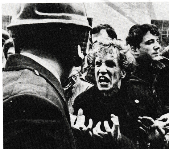
rage (definition 1)—He seethed with rage.