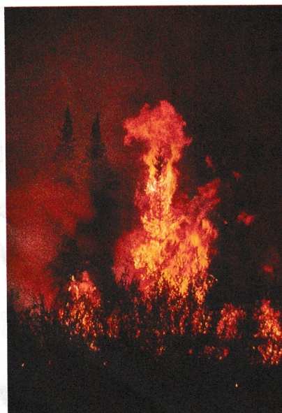
rage (definition 2)—The fire raged through the forest.

rag weed (rag'wēd'), a coarse weed whose pollen is one of the most common causes of hay fever. noun .